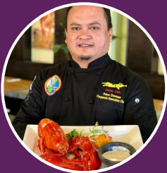
Fatinâsi Kelaguen Challenge