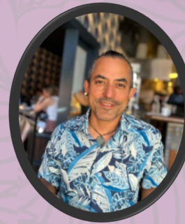
Special Event Coordinator/Vendor Liaison