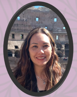
Car Cruz Workshop Coordinators