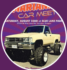
Marianas Auto Show